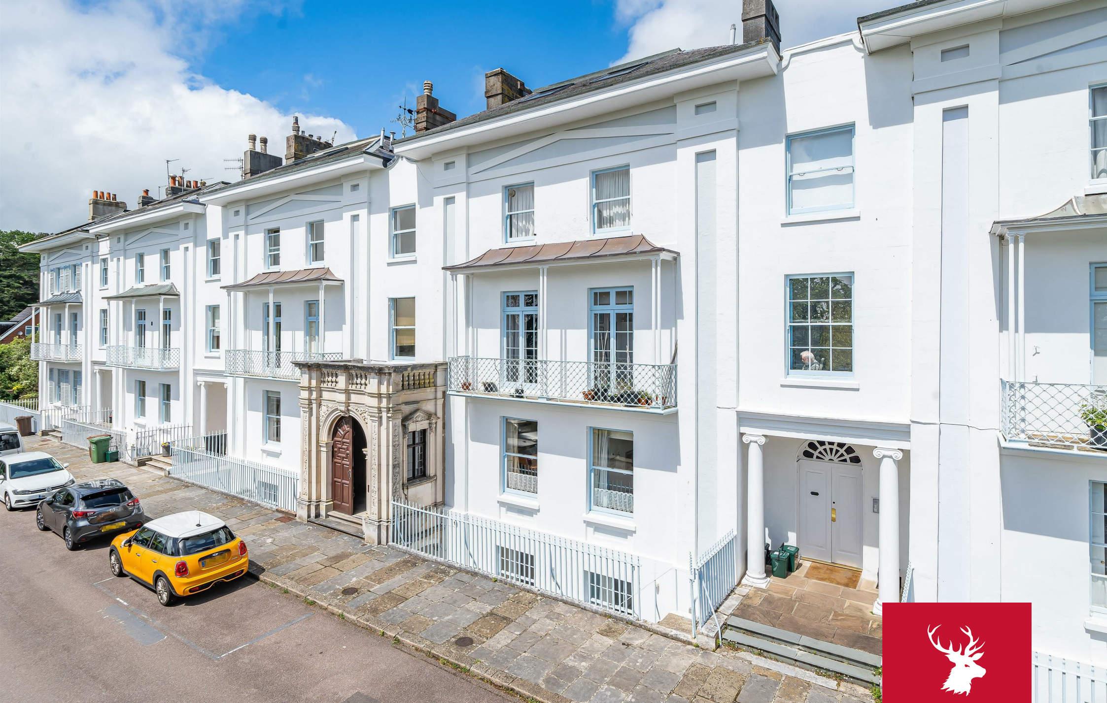
4a, Pennsylvania Park